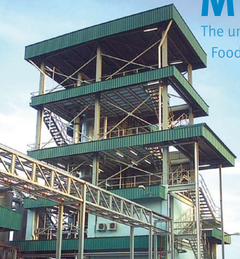
Esterification plant in Pasir Gudang, Malaysia

The unrivalled active oil for Foods · Pharmaceuticals · Cosmetics